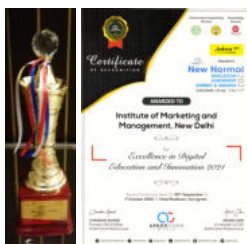
"Excellence in Digital Education & Innovation 2021"