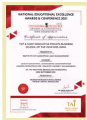
"Top & Most Innovative Private Business School of the Year 2021" India