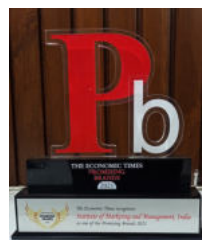
"The Economic Times Most Promising Brand 2021"