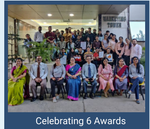
Celebrating 6 Awards

"Success is connected with action, Successful people keep moving. They don't quit."